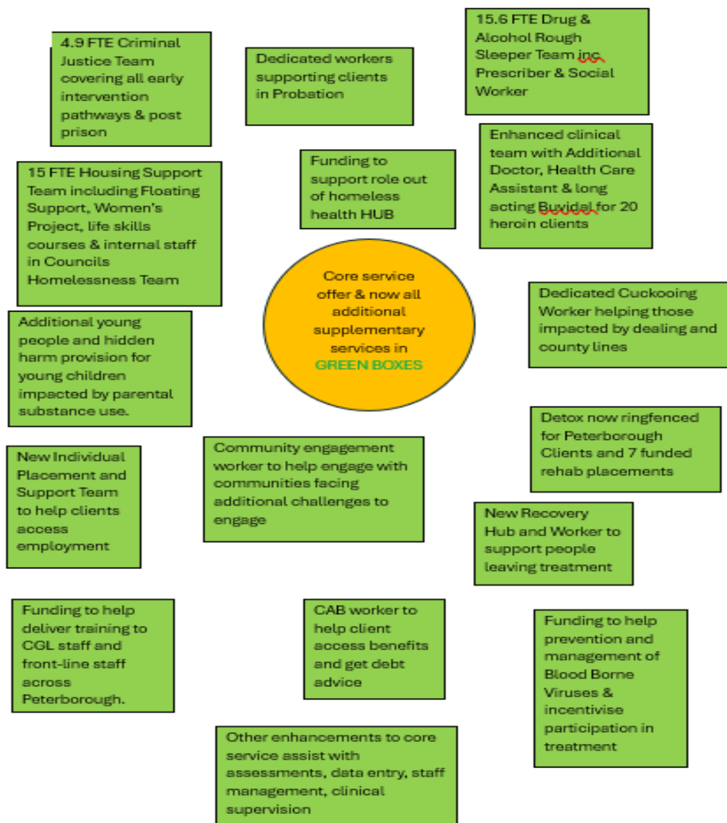
Figure 2 – Additional services provided by the Supplementary Treatment and Recovery Grants.

With the addition of the four Supplementary Treatment Grants, there has been a complete transformation of the drug and alcohol service offer to the residents in Peterborough. Council Commissioners have had an opportunity to radically develop and reshape the offer, using the funding available. Figure 2 below depicts this as an image. The boxes in GREEN summarise the additional areas funded by the extra grants.