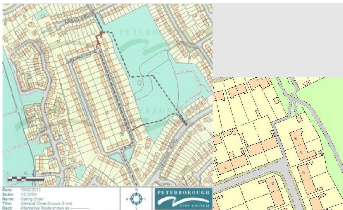
Map showing location of gates and alternative routes and map showing a closer view of the gated alleyway between Welland Close and Crocus Grove