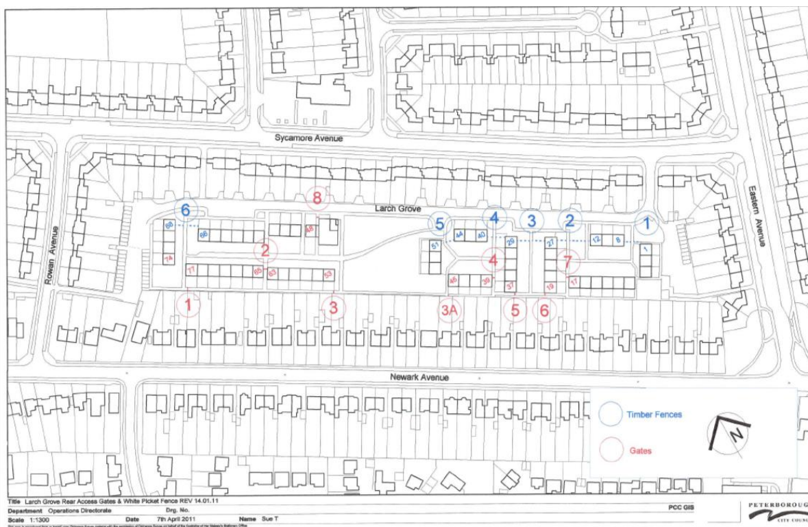
Map showing location of fences (number in blue) and gates (numbers in red) for Larch Grove

Following consultation with statutory consultees, key interested parties and the public, the Public Spaces Protection Order – Gating of Larch Grove was extended on 12 th October 2020 for 3 years.