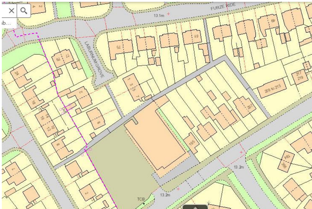
Map showing the alleyways running between Welland Road, Furze Ride Laburnum Grove

Located in Dogsthorpe Ward, the Furze Ride and Welland Road Gating Order was originally implemented in February 2008 and following consultation with statutory consultees, key interested parties and the public, the Public Spaces Protection Order – Gating of Furze Ride and Welland Road was extended on 12 th October 2020 for 3 years.