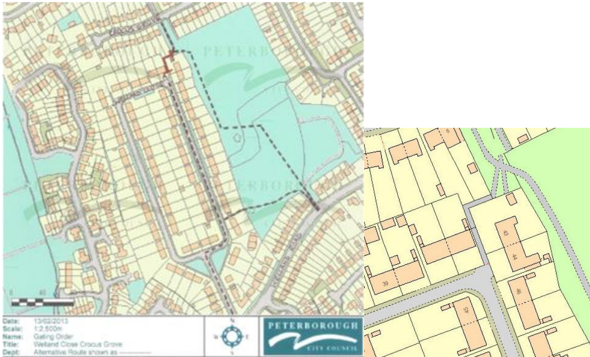
Map showing location of gates and alternative routes and map showing a closer view of the gated alleyway between Welland Close and Crocus Grove