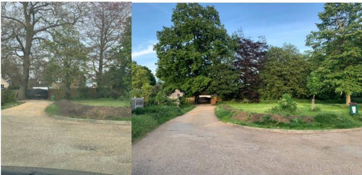
View of Pond House from the private road approaching the park and Pond House in Feb 2021 and June 2021

The Applicant has requested that the following photographs be provided to Members.