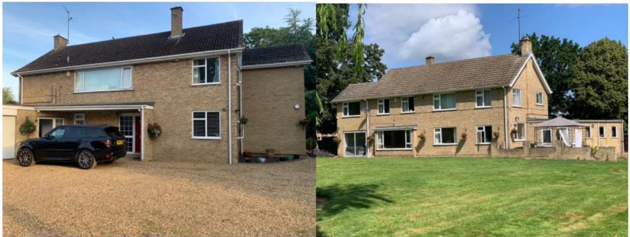
Current elevations of the house