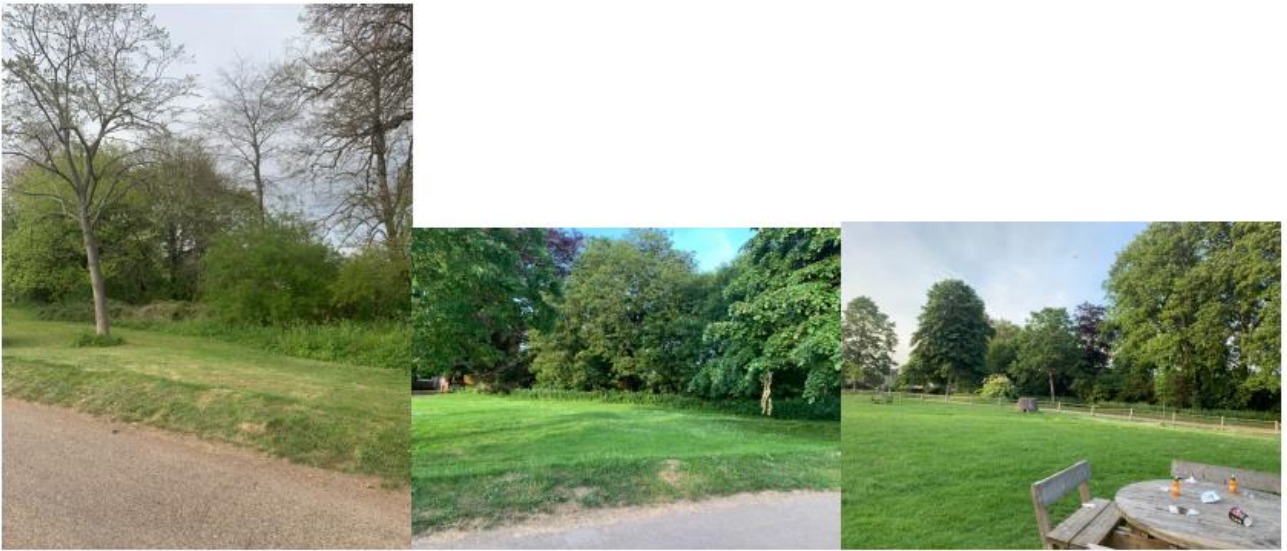
View of Pond House from the Park in Feb 2021 (1 st picture) and June 2021(2 nd and 3 rd Picture)